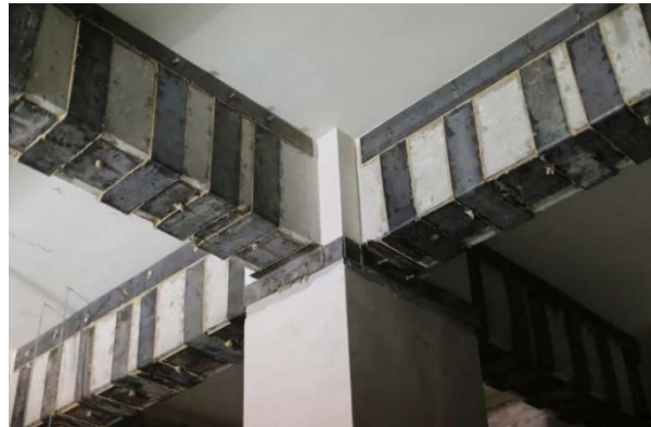
Fig.2 Strengthening Technology of Sticking Steel Plate

load, the fracture reinforcement of thin web beams, and the comprehensive reinforcement of old houses reconstruction.