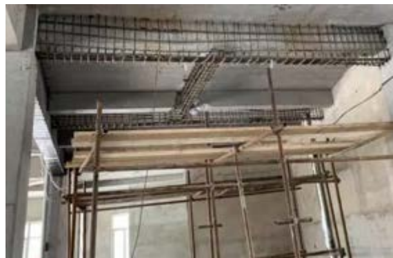
Fig.3 Strengthening Technology of Increasing Cross Section

In order to effectively improve the flexural capacity of normal section, shear capacity of inclined section and stiffness of section of building engineering components, and play an important role in strengthening, it is necessary to increase the concrete rubber layer in the compression area of reinforced concrete flexural members to increase the cross-sectional area and cross-sectional height. In order to ensure the application of this technology to achieve good reinforcement effect. In general, it is required that the concrete strength grade of the structural members of the original building construction project is not lower than C13. See Figure 3 for the reinforcement technology of increasing section.